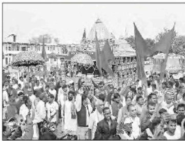
The Ram Rajya Rath Yatra being flagged off from Karsevapuram in Ayodhya on Tuesday. PN

Tiwari said that during the ceremony, it was decided by the organisers that at every stop, local residents will be administered a pledge for the construction of Ram temple "as a reply to the attack on temples by foreign invaders".